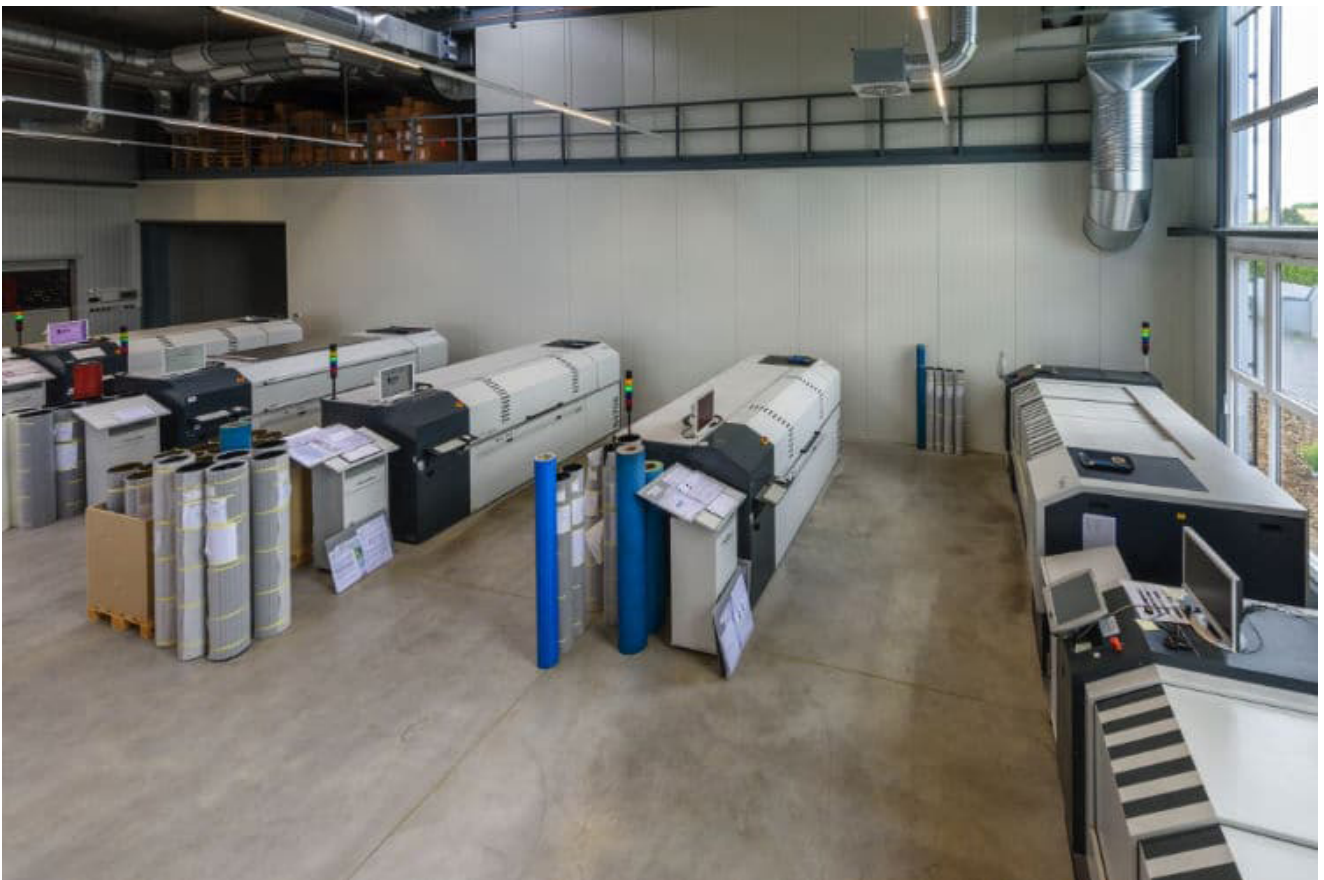
Flex-Punkt currently manufactures with five direct lasers as well as two LAMS lasers from HELL

successful development of Flex-Punkt. The two companies have been working together for 20 years in a very fruitful and trusting relationship. As early as 2001, Flex-Punkt carried out the beta test for the first laser engraving system from HELL. Currently, elastomer and photopolymer sleeves and plates are produced with five direct lasers and two LAMS lasers from Hell.